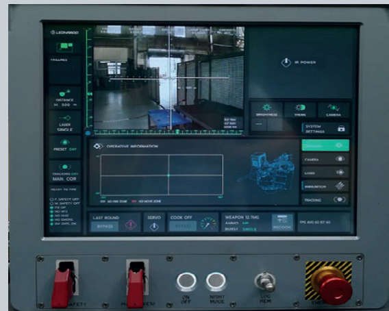
Local Control Panel

(2): Valid for cooled sensor, uncooled one is available too.